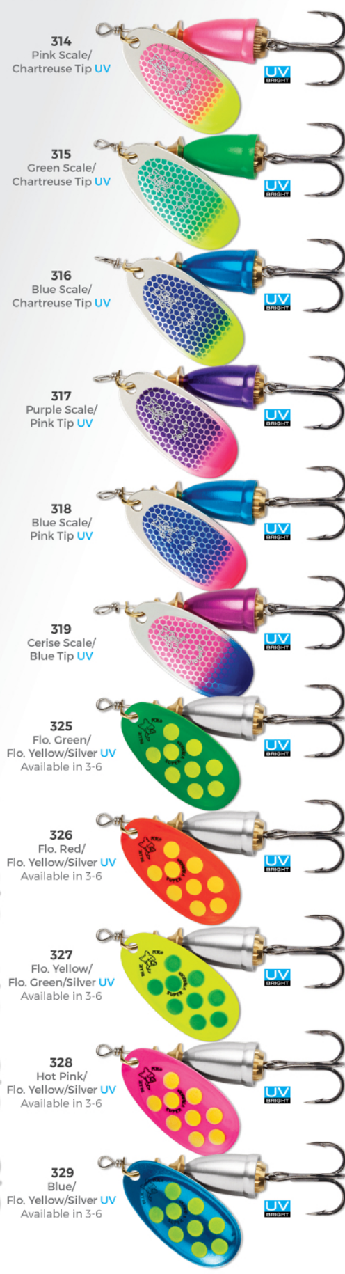
314 Pink Scale/ Chartreuse Tip UV