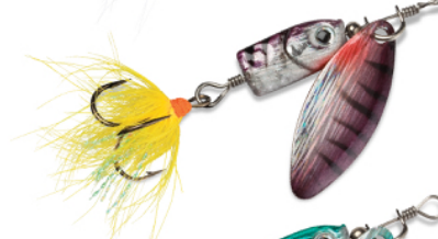
RT Rainbow Trout