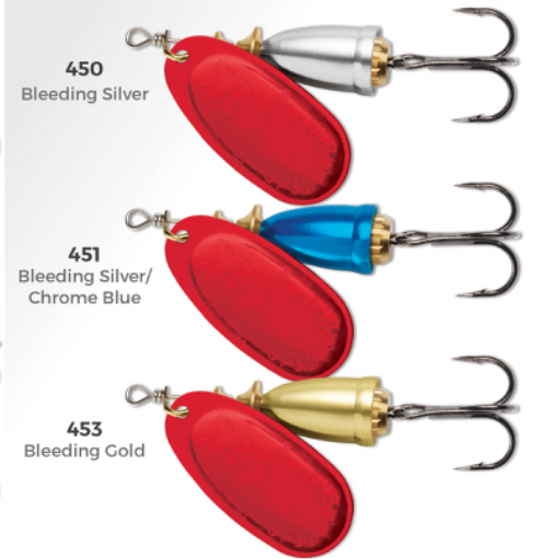
450 Bleeding Silver