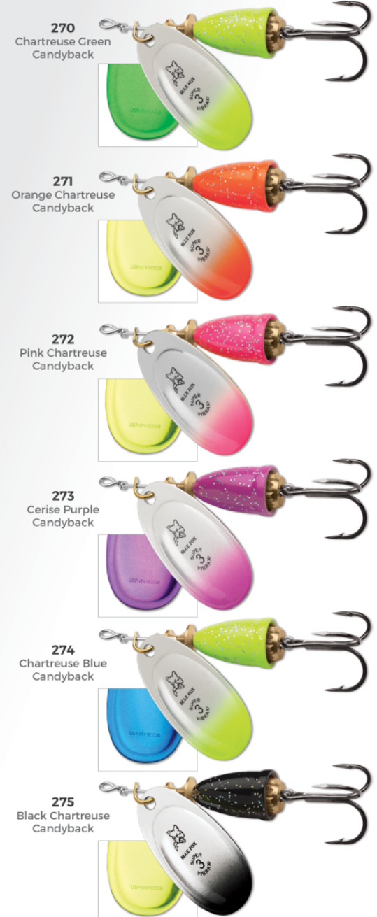
270 Chartreuse Green Candyback