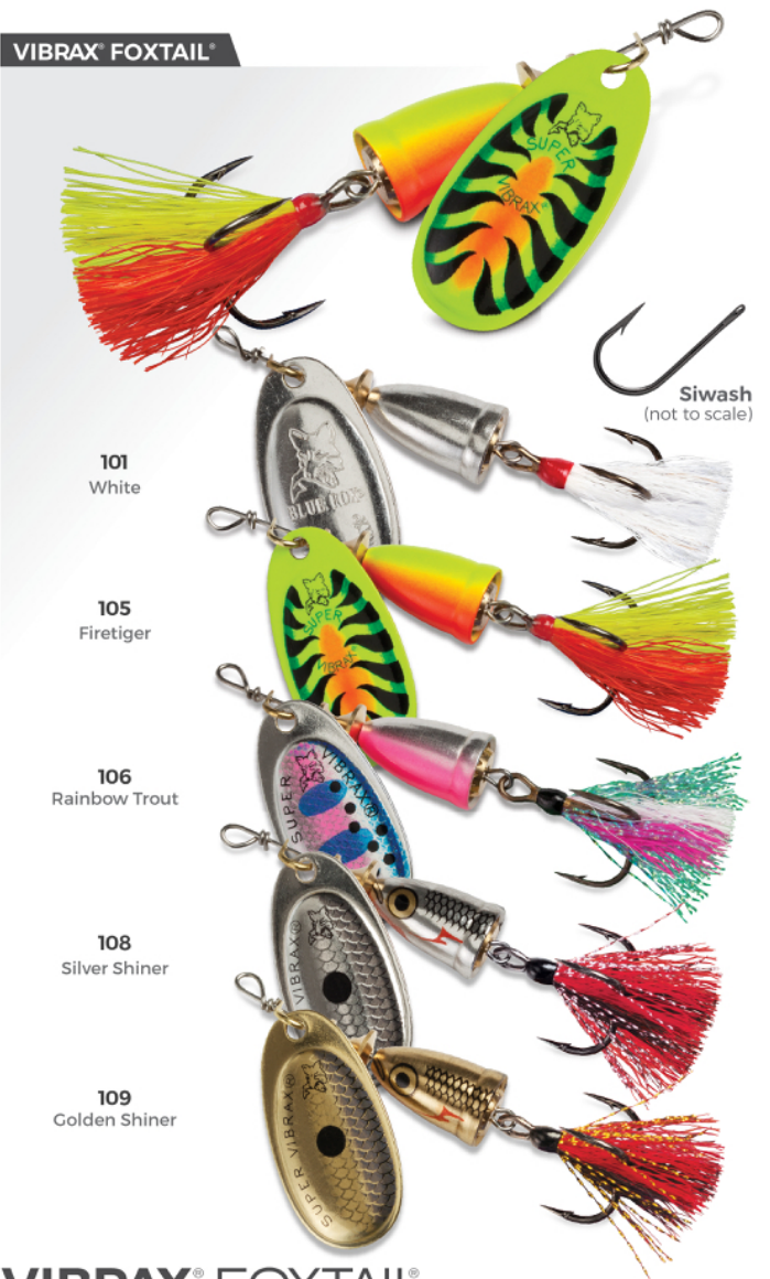
Siwash (not to scale)