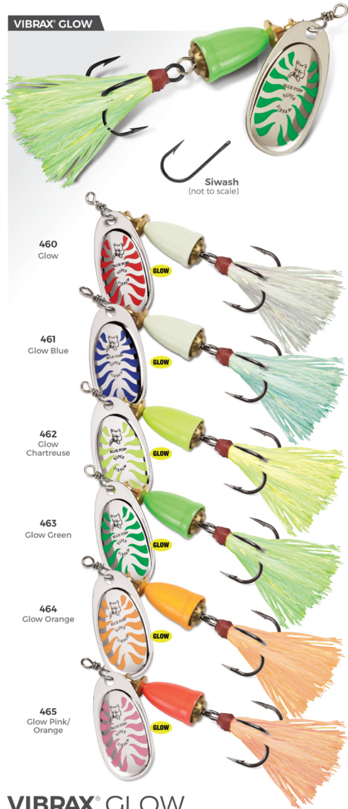
Siwash (not to scale)