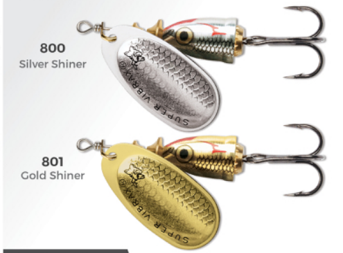
800 Silver Shiner