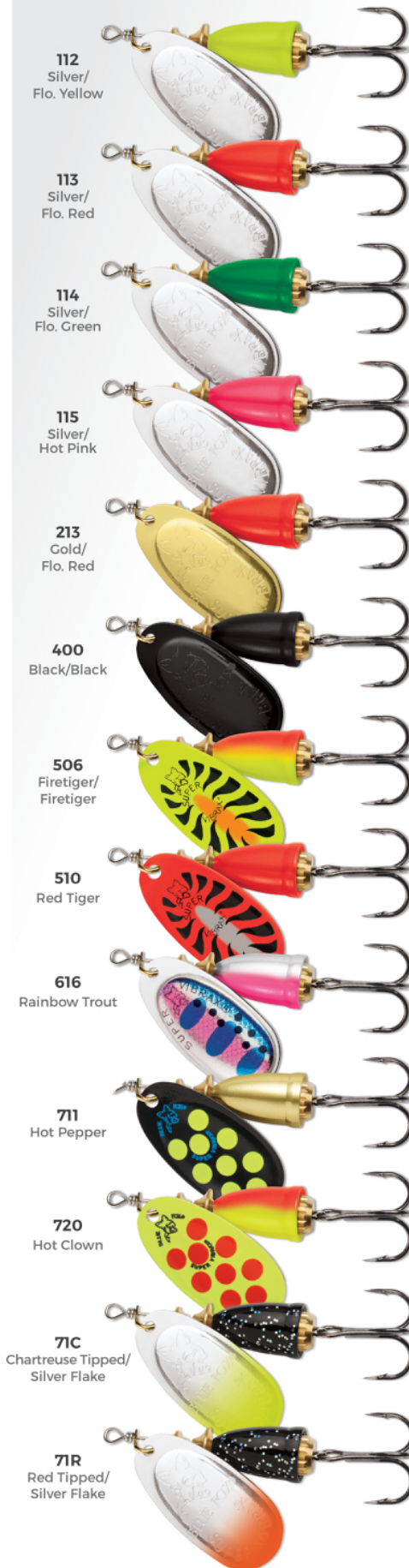
112 Silver/ Flo. Yellow